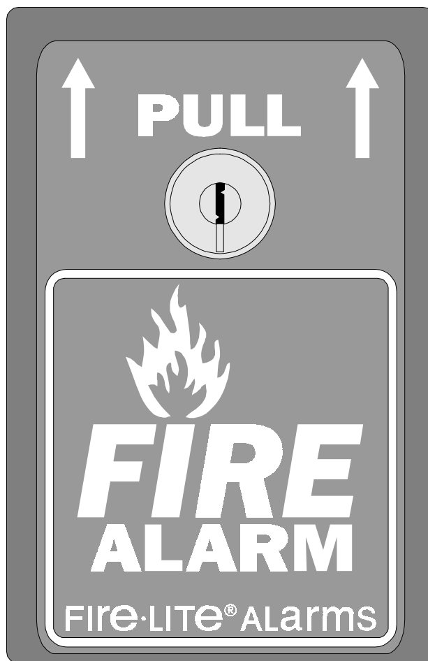
BG-8 (shown full size)

The attractive design of the stations highlights their engineered simplicity and unusual dependability; bumping, shaking, or jarring will not activate the switch or circuit. In-